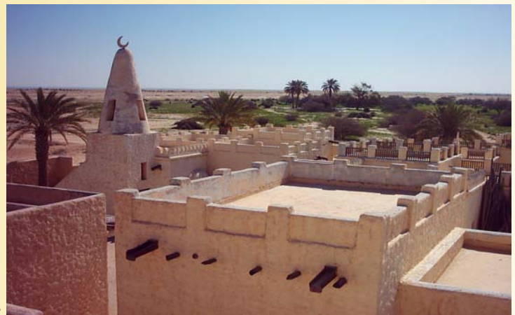
Scene from the Al Reem Biosphere Reserve

respect of men, water, plant and animal life, and biological diversity. The garden network underlines the respect for water and plants as being suggested by the Quran, and based on this, aims to conserve ex situ the natural plant species that occur in the Arabian Peninsula. These activities are major contributions to plant diversity conservation, as well as for the urgent need to assist in building capacity by establishing Centres of Excellence for Botanic Research, Education, and Conservation.