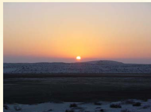
Khor al Udayd—The Inland Sea

We would like to underline our aspiration that most activities, in the long-run, are designed to tackle environmental issues on a science platform, and to contribute encouraging young people to become active in environmental awareness, behaviour, education, and entrepreneurship, and we hope that some of our activities will inspire the youth to find jobs and income based on our initiatives.