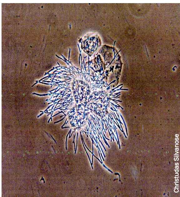
Fig. 1 Phase-contrast microscopic appearance of Cyanobacteria sp. attached to exfoliated epithelial cells from the oro-pharynx of a green sea turtle.

Oro-pharyngeal and cloacal swabs were examined from 45 clinically normal green sea turtles including 36 adults (19 females and 17 males) and 9 juveniles. Direct wet preparation from the oro-pharynx showed budding yeast cells ( Candida sp), protozoa, diatoms, Chlamydomonas sp, Cyanobacteria sp, Cristispira sp, Crustacean larvae and various motile bacteria. Direct wet preparation from the cloaca showed budding Candida cells, diatoms and bacteria.