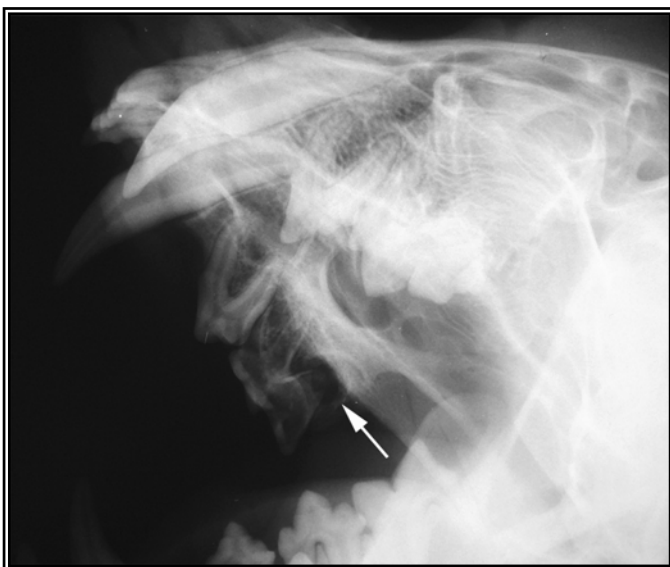
Fig. 5: Open mouth right ventral- left dorsal oblique view of maxilla - the radiolucency around the apex of caudal root of the upper carnassial tooth (arrow) and decreased alveolar bone density of lamina dura consistent with periodontal (periapical) abscess.

Radiography revealed a zone of radiolucency surrounded the apex of caudal root of the left upper carnassial tooth. The apex of the tooth root and the alveolar bone were partially resorbed. Meanwhile the pulp cavity of the carnassial tooth seemed to be enlarged. The radiographic changes were indicative of periodontal (periapical) abscess of the left upper carnassial tooth (Fig. 5).