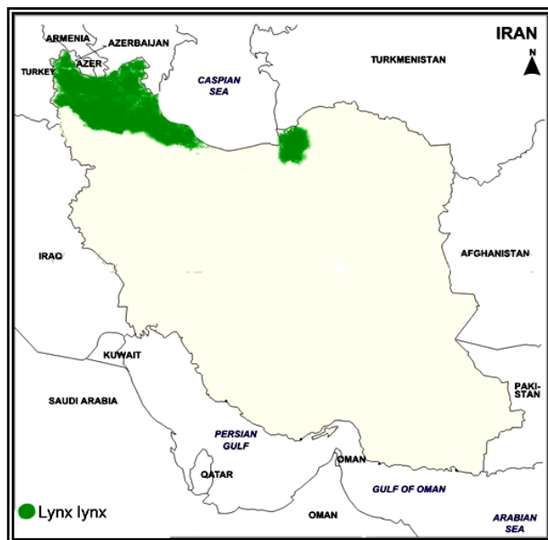
Fig. 2: Distribution of Lynx lynx in Iran (ZIAIE 1996)

The increasing urbanization and domestication of Western Europe, and the resulting significant loss of habitat and diminished prey base, have led to a severe reduction of the Eurasian Lynx population. The scientific literature cites numerous types of pathological dental conditions that occur spontaneously in free-ranging populations. Dental problems often may not manifest themselves in conspicuous ways. Chronic weight loss and malnutrition may have various dental origins, ranging from acute sepsis and pain to malocclusion or oligodontia (FOWLER 1986). Abscessed teeth occur frequently. The abscess may be secondary to periodontitis or fractures of the crown of teeth. The clinical signs of abscessed teeth may range from a unilateral swelling of the mandible or maxilla on the affected side to draining facial fistulas (WALLACH AND BOEVER, 1983).