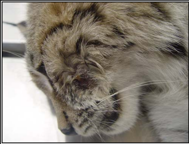
Fig. 3: The wound with purulent exudates on the face.

diograph were done up and then she was referred to surgery section.