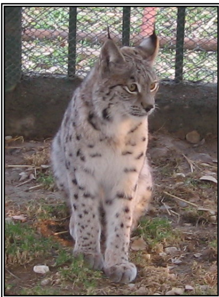
Fig 1: Lynx lynx

The Eurasian Lynx ( Lynx lynx ) (Fig. 1), was once considered a subspecies of the bob-tailed cat complex that includes the Canada Lynx ( Lynx Canadensis ), Iberian Lynx ( Lynx pardinus ), and the Bobcat ( Lynx rufus ). Today, most scientists consider these four cats to be separate species, with the Eurasian Lynx being the largest in size, as well as distribution (FIROUZ 2000). The Eurasian Lynx has been reported in different areas from North-west to North-east provinces of Iran (Fig. 2) (ZIAIE 1996).