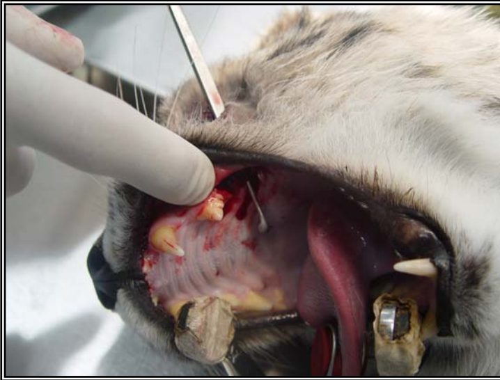
Fig. 6: The abscess, fistula and the wound were debrided