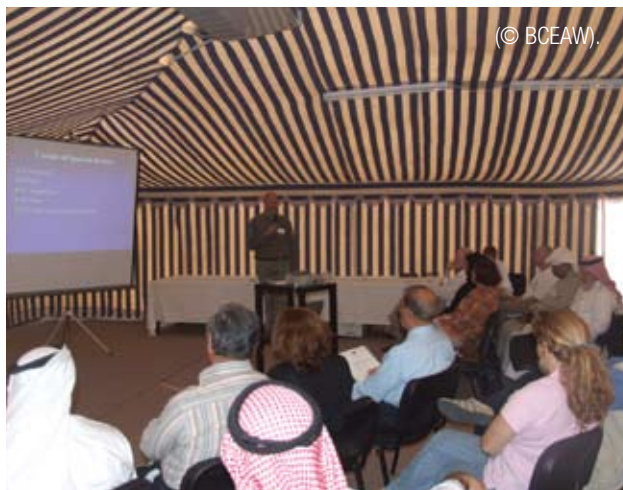
Fig 1. Previous CAMP workshop

Formal invitations to our regional colleagues will be sent out shortly. For more information contact: Breeding Centre for Endangered Arabian Wildlife, P.O. Box 29922, Sharjah, United Arab Emirates. E-mail: breeding@epaa-shj.gov.ae