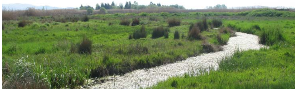
Wetland Hima of Kfar Zabad.

Another example of the Hima system is the Ammiq Marsh (Lebanon's most significant remaining natural freshwater site and one of the few in the Middle East). This major stop-over site for migrating birds was under severe threat. Since 1996, A Rocha Lebanon ( http://en.arocha.org/lebanon/ ) has been initiating conservation programmes with private landowners, local communities and religious groups in the west Bekaa. Additionally it has worked nationally to engage religious communities in nature conservation and sustainable resource management. During the same period, work with the landowners of the Ammiq Marsh using Hima principles has led to the protection and restoration of this internationally important wetland. This is a unique project in Lebanon and has resulted in the cooperation between private landowners and an N.G.O. which has created the country's first private reserve which is now a designated Ramsar site.