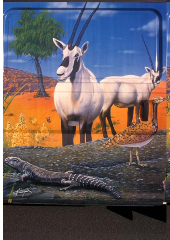
Nature bus of the Environment Education and Awareness Division', Environment Agency- Abu Dhabi