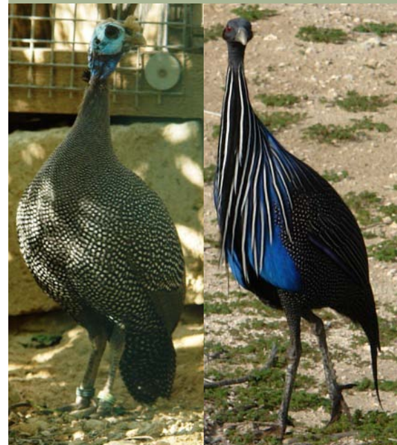
Adult male Somali tufted guineafowl at AWWP.

Available for download from the pdf website version at wmenews.com