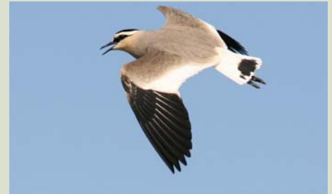
The Sociable Lapwing ©Mahmoud Sheish Abdallah.

http://www.birdlife.org/news/news/2007/03/sociable_lapwing_discovery.html