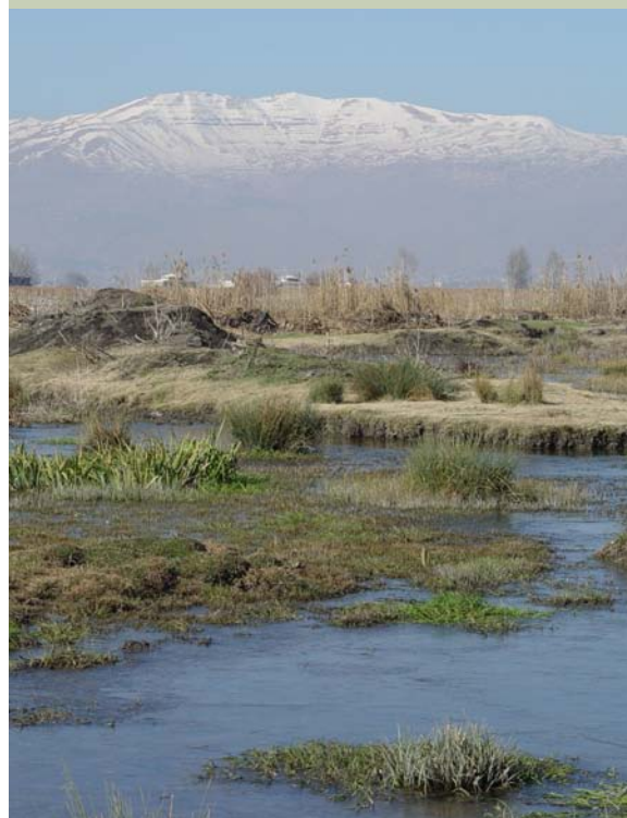
Wetland Hima of Kfar Zabad ©SPNL.

In many cases, the Hima approach may be cost-effective and help to engage support from sources not used or available to Nature Reserves. Hima status may also provide greater opportunities for sustainable human use of natural resources, and therefore, make a greater contribution to poverty alleviation for people whose use of natural resources forms a critical component of their livelihood strategies.