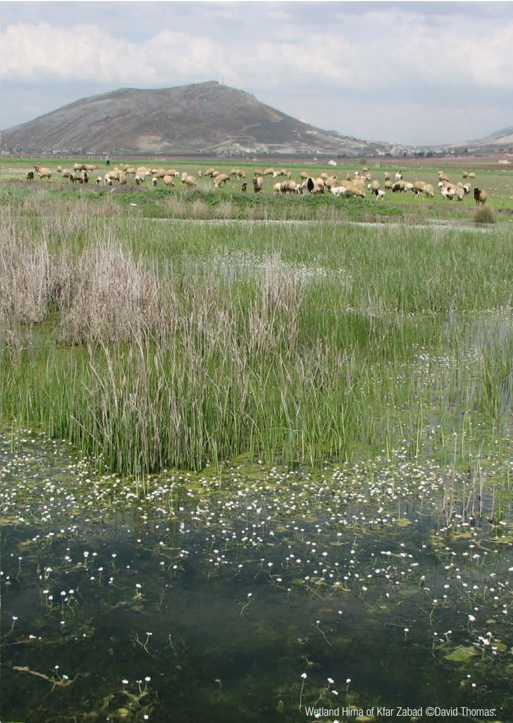
Wetland Hima of Kfar Zabad