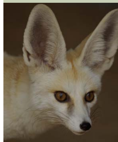
Ruppell's sand fox © Declan O'Donovan.

We thank Emirates Airlines for their continued support and sponsorship of the Dubai Desert Conservation Reserve.