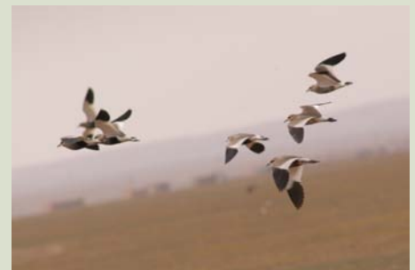
Sociable Lapwing: less than 1500 were thought to exist before today’s announcement ©Koshkin Maxim.