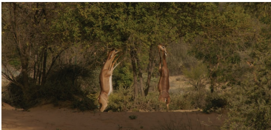
Gerenuk feeding on browse trees at Wadi al Safa Wildlife Centre, Dubai ©Declan O'Donovan.

Boredom and obesity are major problems in zoo animals in general and feed-related stereotypic behaviours, due to limitations of natural stimulants, are common (Ulrey, 1996). Good nutritional management includes not only meeting the animal's differing physiological requirements, but also consideration for its psychological well-being. Unfortunately, many keepers tend to offer their animals very digestible, processed and often nutritionally unbalanced feeds (e.g. high energy pellets, young grass, boneless meat etc.) and make these available ad-lib, which leads to over consumption and disease. For example; feeding too much energy (mostly from sugars, starches and fructans) through either pellets, grain or grass can cause metabolic bone disease (mbd) in ratites (Bennet et al, 1991) and rumen acidosis in zoo ungulates (Van Soest, 1996); feeding de-boned meat (often done for reasons of tidiness) to captive carnivores and raptors is sadly a common practice and leads to mbd, suffering and death.