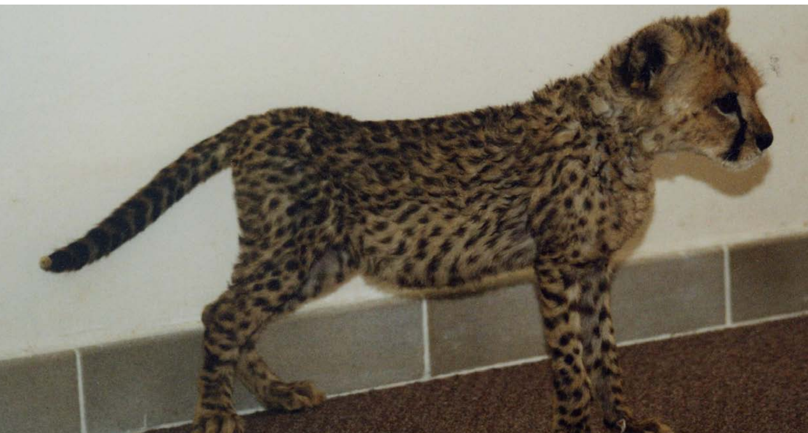
Cheetah cub with bilateral hip abnormality showing poor stance caused by poor nutrition.