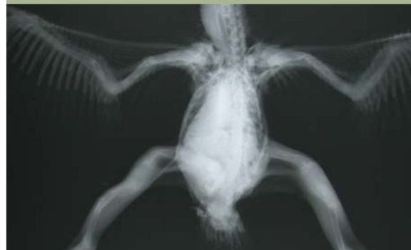
Radiograph of a Bonelli's eagle chick with metabolic bone disease ©Tom Bailey.

Available for download from the pdf website version at wmenews.com