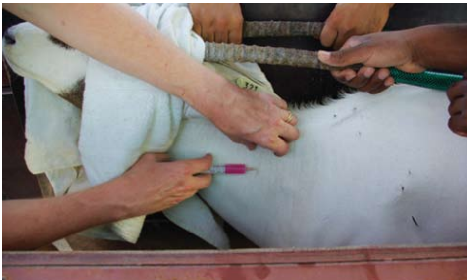
Fig1. Arabian Oryx being vaccinated against FMD in a Tamer at Site 2

A second edition is planned for 2010 if you are interested to submit a re-introduction project article please contact the Editor at psoorae@ead.ae