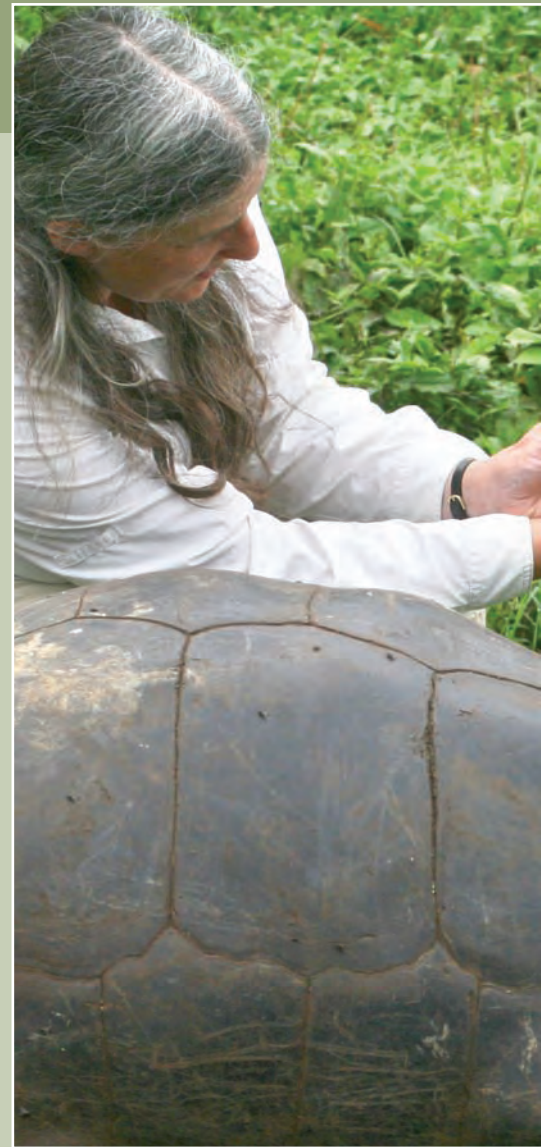
Fig 1 Author with aldabra tortoise and UV meters

We're looking forward to hearing the results, and are keen to assist, wherever possible, in any similar ventures. For further information on the role of UV light in reptile husbandry please visit our website.