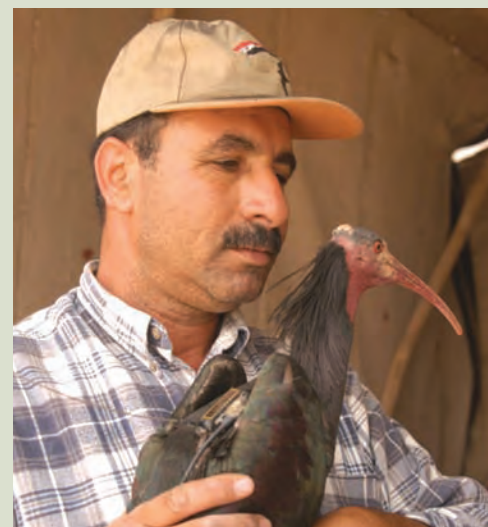
Fig 2. A Northern Bald Ibis is fitted with a satellite transmitter in Syria

As a response to the BirdLife Preventing Extinctions Programme, HSH Prince Albert II of Monaco became Species Champion for Northern Bald Ibis, earlier this year, providing crucial support to this challenging programme through the Prince Albert II of Monaco Foundation. BirdLife is more determined than ever to conserve this emblematic species that has braved the Middle East and north African deserts for millennia inspiring cultures and religions of the region.