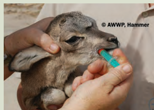
Fig 2. Oral newborn treatment with Bio-Weyxin®.

For more detailed information, tables, references and acknowledgements please refer to the link below: http://awwp.alwabra.com/images/stories/awwp/scie ntific/SP.86/SP.86.pdf