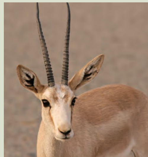
Fig 2. Female G. s. marica from Mahazat as-Sayd PA.