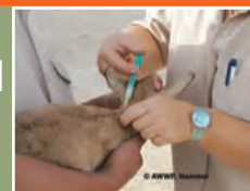
Fig 1. Injection of Heptavac® in a newborn gazelle.

Meier M 1 , DEB A 2 , Hammer C 2 , HAMMER S 2