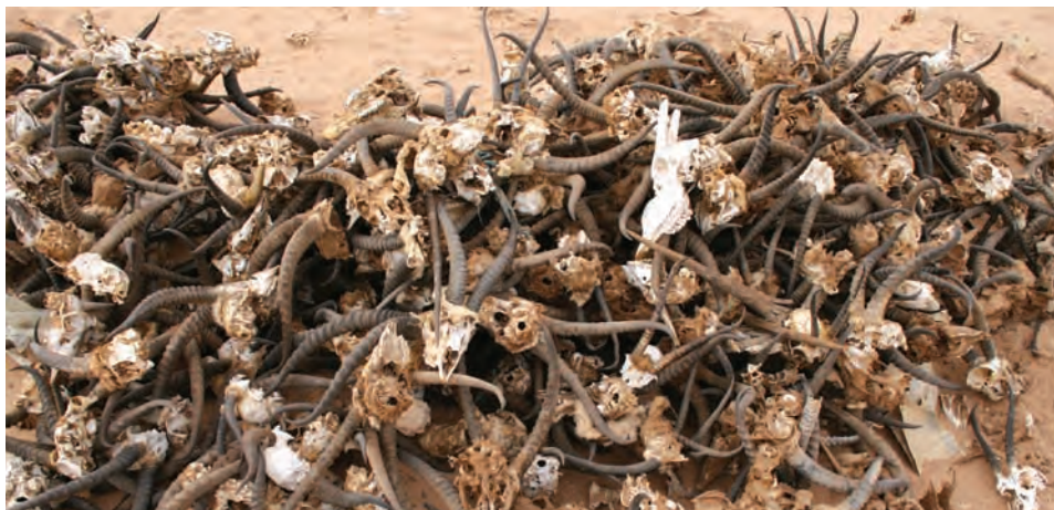
Fig 1. G. s. marica mortalities due to drought in the Mahazat as-Sayd PA.

Reem outside Protected Areas are almost certainly extinct in Saudi Arabia aside from reports of individuals occasionally encountered in the south eastern Rub Al Khali. The numbers in Harrat al-Harrah and Al-Khunfah have decreased alarmingly, and are currently perceived to be virtually extinct. The reintroduced populations in Mahazat As-Sayd and Uruq Bani Ma'arid persist although numbers fluctuate according to local environmental conditions. Little importance is placed on responsible management of the large numbers of reem in private collections thus decreasing their usefulness as a 'national herd' or for future reintroduction purposes.