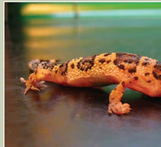
Fig 2 Leopard gecko with metabolic bone disorder