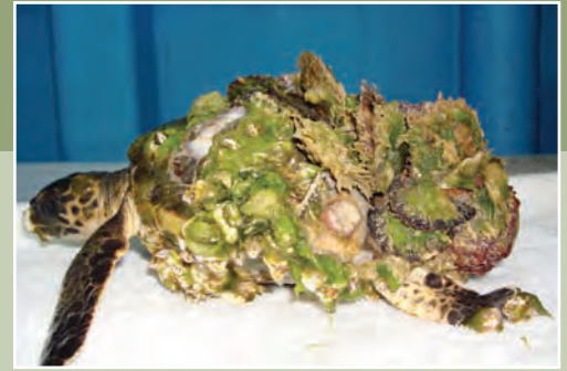
Fig 1+2: Juvenile Hawksbill turtle covered with epibiont (barnacles), and after treatment

Elevations in total protein (TP) combined with WBC abnormalities indicated chronic inflammation. Animals with TP levels under 2 g/dL were retained for further treatment. Frequently these individuals were obvious from visual examination alone, exhibiting poor body condition. Suspected starvation or parasitism cases were treated individually. For practical purposes we found the most relevant biochemical value to be creatine kinase (CK). CK is purely a muscle enzyme, so increased values may be related to muscle damage attributed to starvation, stranding or capture/handling for procedures.