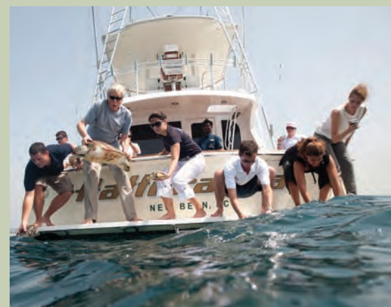
Fig 3: Latest release of 22 juvenile Hawksbill and 2 mature Green sea turtles.