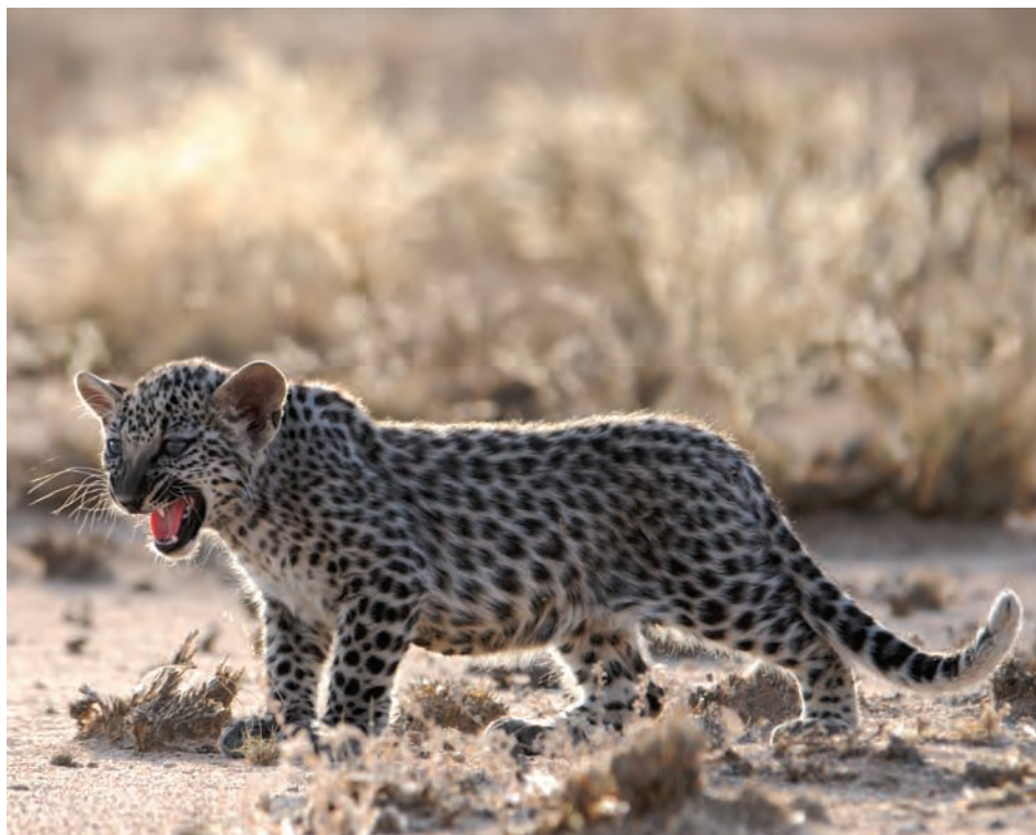
Fig 1. Arabian leopard cub (© O. Coupe/NWRC).

On 25th June 2007 a board meeting was held at the NCWCD to discuss the National strategy for Arabian Leopard conservation. The NWRC was identified as the most suitable place to conduct this project, because the research center already had facilities to house animals. At present, 5 individuals (3 males and 2 females) are kept in the Center and 3 (1:2) have been loaned for breeding to the Breeding Center for Endangered Arabian Wildlife (BCEAW) of Sharjah, UAE.