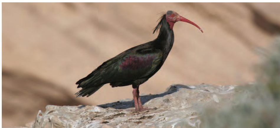
Fig 1. A Northern Bald Ibis (©Jean Paul Tilly; www.rarebirdyearbook.com).

More satellite-tagged birds released from Turkey this year, flew south as far as Saudi Arabia but they too disappeared not much more than 100 km from where the Syrian bird was shot. Although their fate has not been established, researchers believe these birds too may have succumbed to hunters.