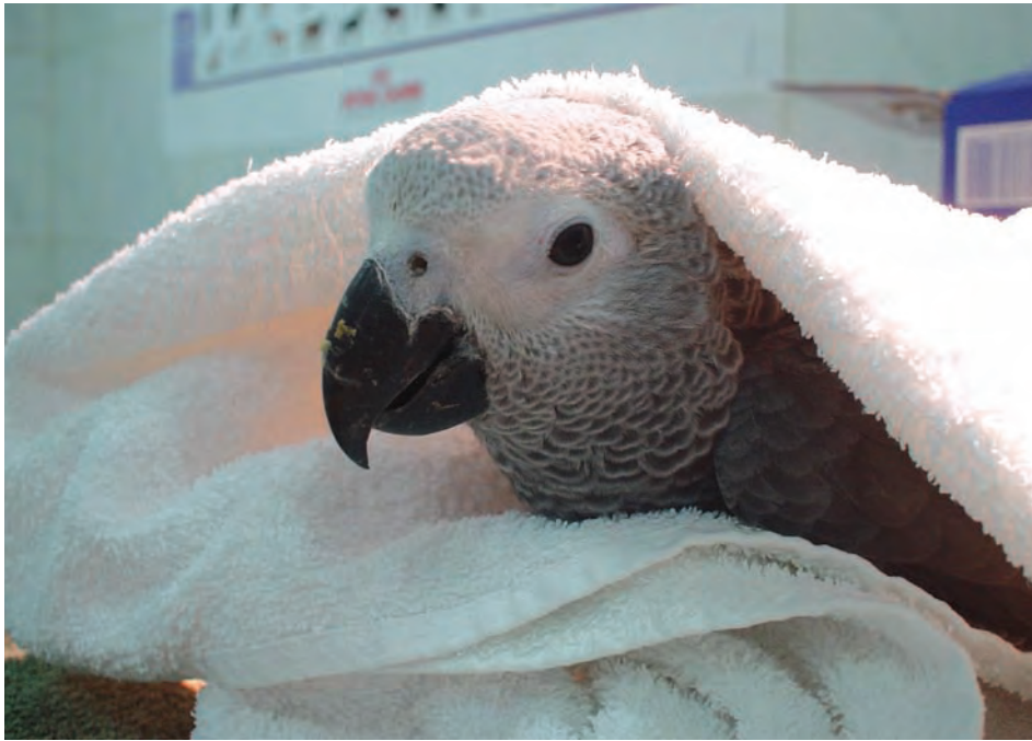
Fig 1. African grey parrot.