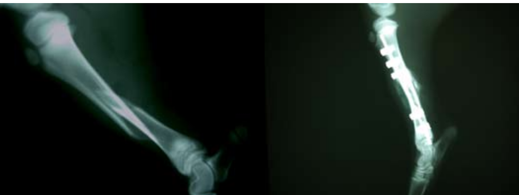
Figure 1. Latero-lateral radiograph of the left tibia of a juvenile male Arabia oryx ( Oryx leucoryx ) showing a closed low energy midshaft oblique fracture. Note the growth plates typical of a growing ungulate.

Acknowledgments: The authors thank the staff of the Veterinary Science Department, Wildlife Division at Wrsan for their help. A longer, fully referenced version of this contribution is available on the WME website.