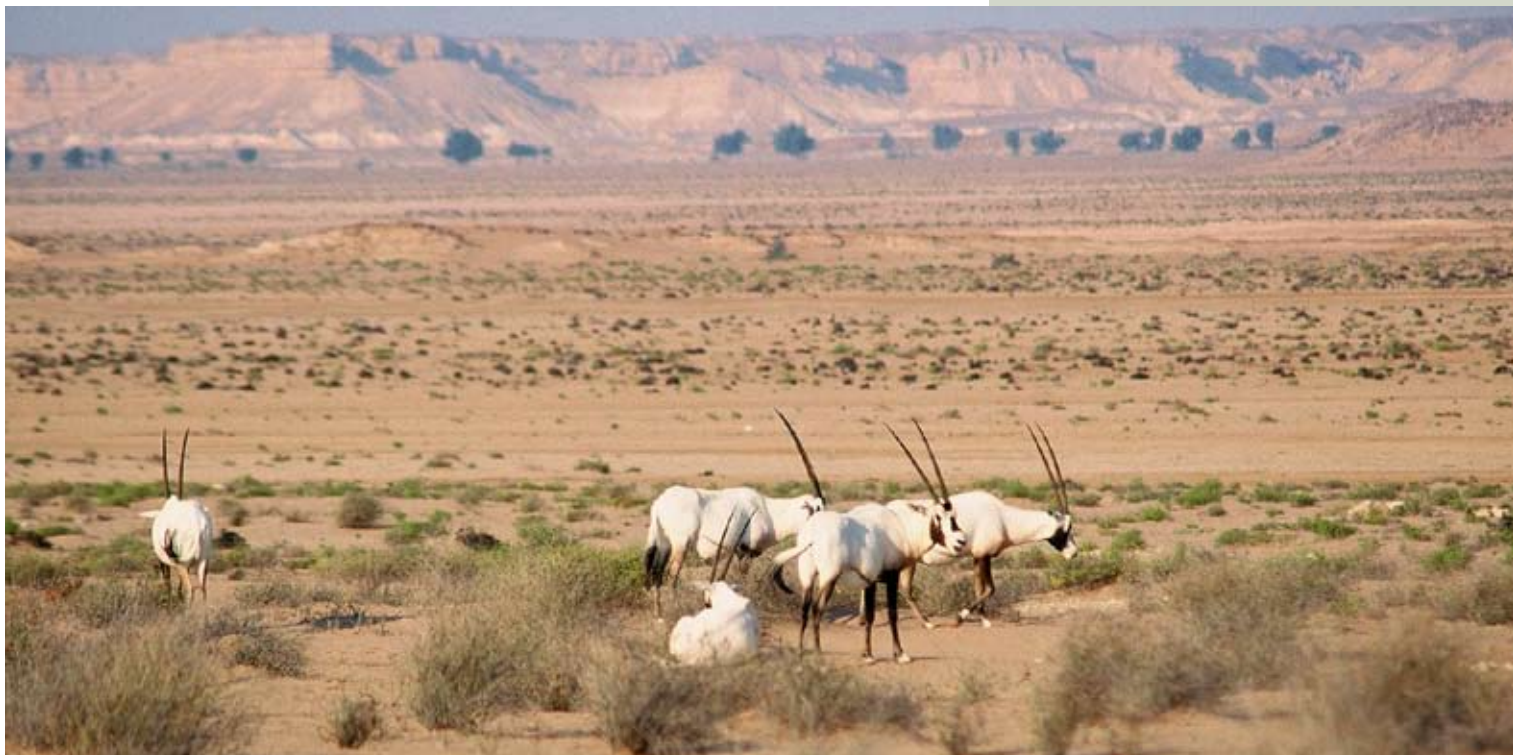
Figure 1. Despite recent setbacks, wild oryx herds could again become a common site in the Arabian Oryx Sanctuary of Oman.

Currently this population of more than 850 animals is the only viable, self-sustainable Arabian oryx population in the peninsula. However, an earlier population model suggested that the success of this population in combination with the fenced nature of the area could be its downfall over the long term. Variability in rainfall and the resulting periodic food shortages could lead to large-scale population fluctuations and even extinction. Food shortages have already occurred within the area during some years with relatively large numbers of animals dying as a result. However, due to the