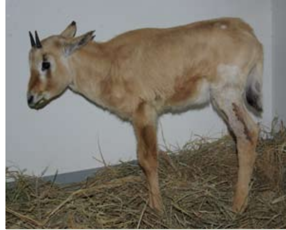
Figure 3. Oryx calf with external fixator device.

Six days after surgery the oryx was found holding the leg up and not been able to place any weight on it. A close examination and a follow up radiograph revealed that the proximal pin on the proximal