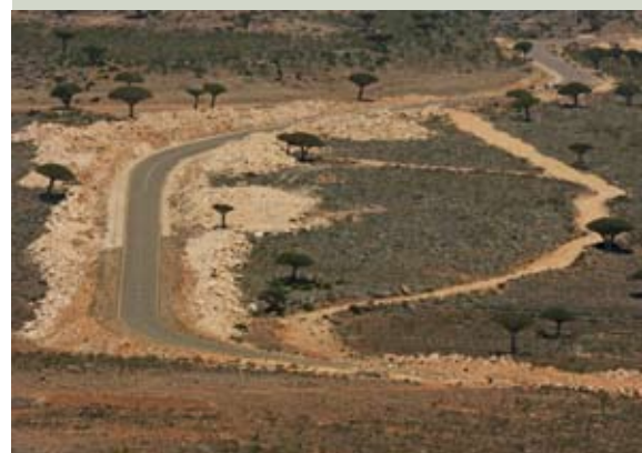
Figure 3. One of the badly landscaped roads on Socotra.