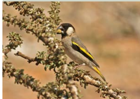
Figure 2. Socotra Golden-winged Grosbeak on Croton.

BirdLife is calling on the government of Yemen to build only essential roads that are beneficial for local communities, in a way that is sensitive to the environment. In addition, the cost saving would be enormous, allowing much needed small-scale local development, and there would not be the serious impact on wildlife and the island's increasingly important eco-tourism. "It would be a global tragedy if this programme were to affect Socotra's chances of becoming a World Heritage Site», says Porter.