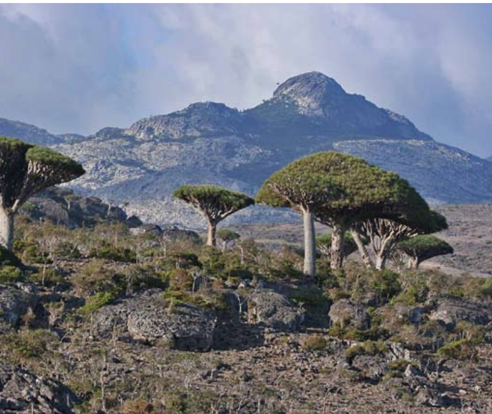
Figure 1. Dragons Blood Trees in the Haggier foothills.

However, sensitive and ecologically important areas of Socotra are currently threatened by uncontrolled development, in particular the proposal to construct a new road system. The scale and construction of many new roads is inappropriate, given the sensitive nature of the Socotran ecosystem. If these roads are built they will seriously impact on the island's wildlife and especially its unique plants and birds. Nineteen bird species of conservation concern could be affected because of the likely destruction of their breeding habitat and nest sites. These include Jouanin's Petrel, Island Cisticola Cisticola haesitatus , Socotra Warbler Incana incana , Socotra Starling Onychognathus frater , Socotra Sunbird Nectarinia balfouri , Golden-winged Grosbeak Rhynchostruthus socotranus and Socotra Bunting Emberiza socotrana .