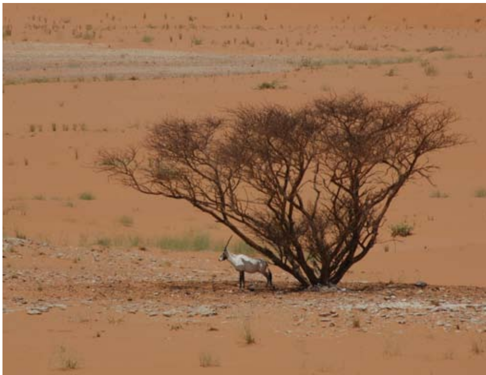
Figure 2. Oryx in 'Uruq Bani Ma'arid are subjected to highly variable environmental conditions and a long-term metapopulation management approach could help ensure population persistence.

It is therefore estimated that a maximum of 20% of all the oryx in the peninsula are currently of known conservation value. Those collections that can potentially contribute to conservation needs to be identified and breeding management plans should be agreed upon, implemented and adhered to. It is therefore encouraging to note that the Coordinating Committee for the Conservation of the Arabian